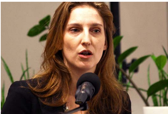
Yvonne Gimpel © Patrizia Gapp

In this context I need to mention the new UNESCO instrument, which is only some years old and reacts on this development. This UNESCO instrument underscores the dual nature of cultural goods and services: having an intrinsic value, conveying values and meaning, contributing to identities and well-being, and at the same time having economic value. This UNESCO instrument aims to ensure that both aspects are seen and respected. It's called: the UNESCO Convention on the Protection and Promotion of the Diversity of Cultural Expressions – quite a long title, therefore often only called Convention on Cultural Diversity . But it was this basic idea and possible conflict of different perspectives, which led to the creation of this Convention.