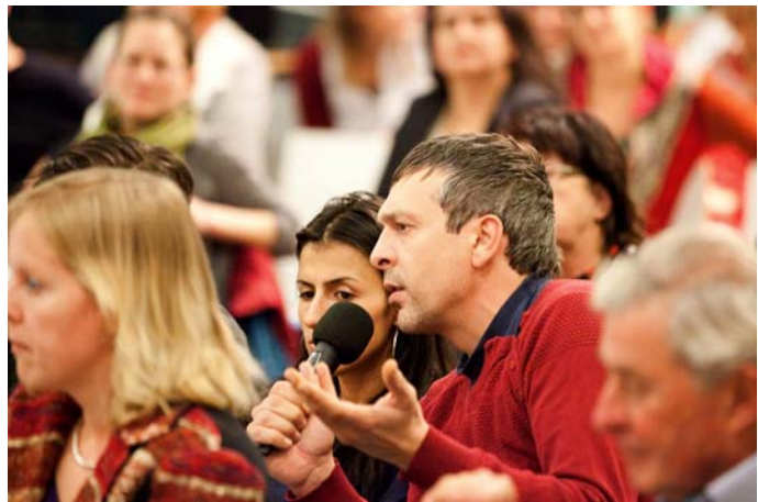
Publikum

equipment like studios, etc. Most of the time culture is defined by the economy. It's a capitalistic system, which means you need a lot of money to get that kind of improvements and then you make it less accessible. You showed us that the strength of the Nigerian film industry is its connectedness to its audience. How could you manage to get improvements in terms of diversity of topics, quality of films, etc. without losing this connectedness to the audience, which is a trademark of the Nigerian film industry?