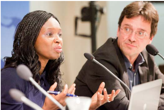
Ade Solanke © Patrizia Gapp

The popular culture issue is very interesting. Do you know much about the Nigerian popular culture landscape?