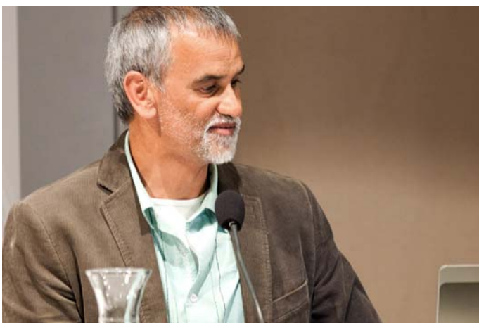
Mike van Graan

Rather than models and strategies appropriate to western democracies, for example the creative industries or models and strategies that work for China – such as high growth and low democracy – if the end of development is people and their well-being, their fundamental freedoms and human rights, then we need to create informed, multi-layered, holistic developmental approaches appropriate to varying African conditions that vary both within and between regions and countries.